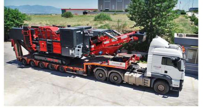
EASY TO TRANSPORT DUE TO FOLDABALITY